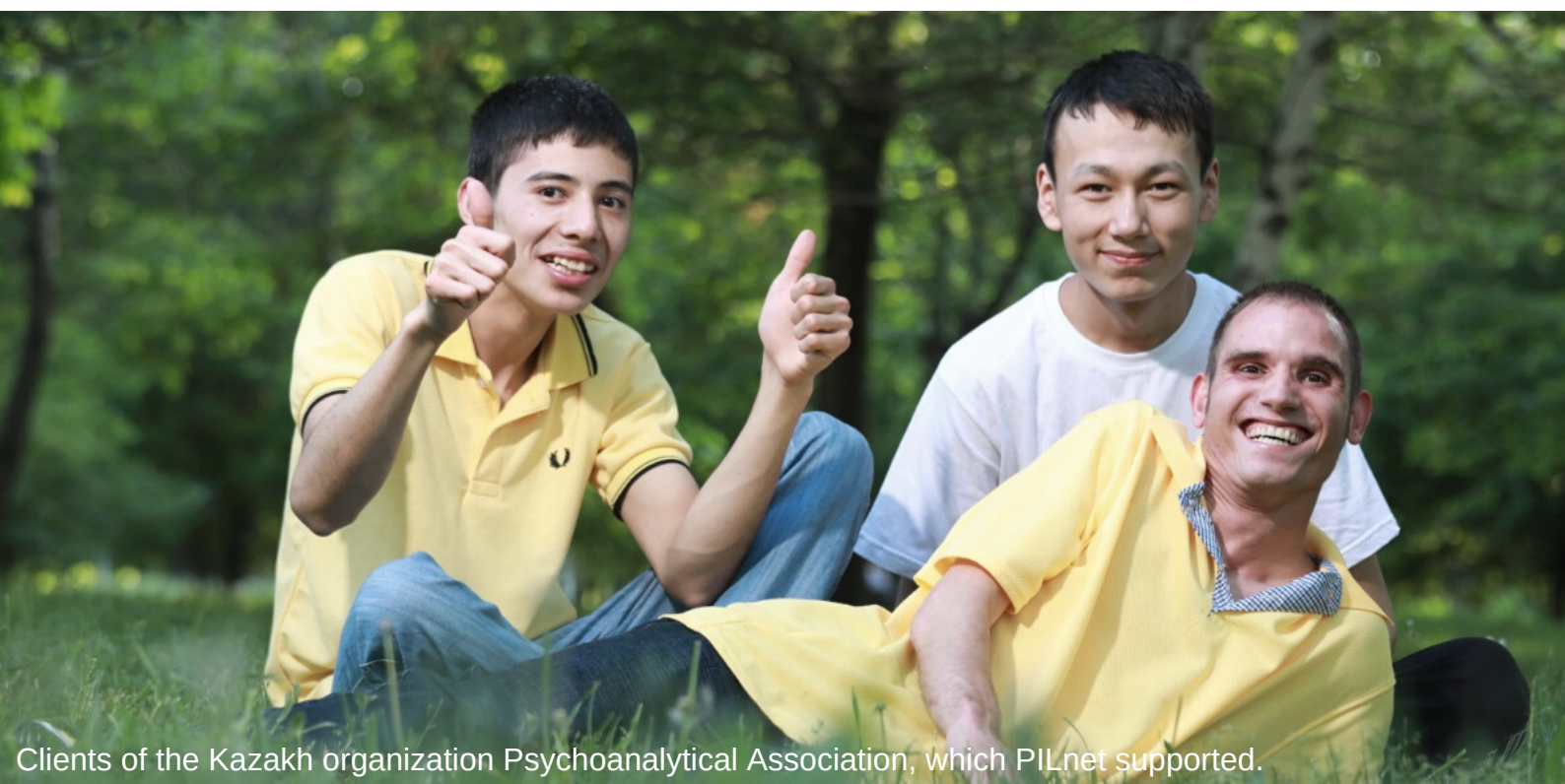
Clients of the Kazakh organization Psychoanalytical Association, which PILnet supported.

Help PILnet make law work for all in 2020 and beyond.