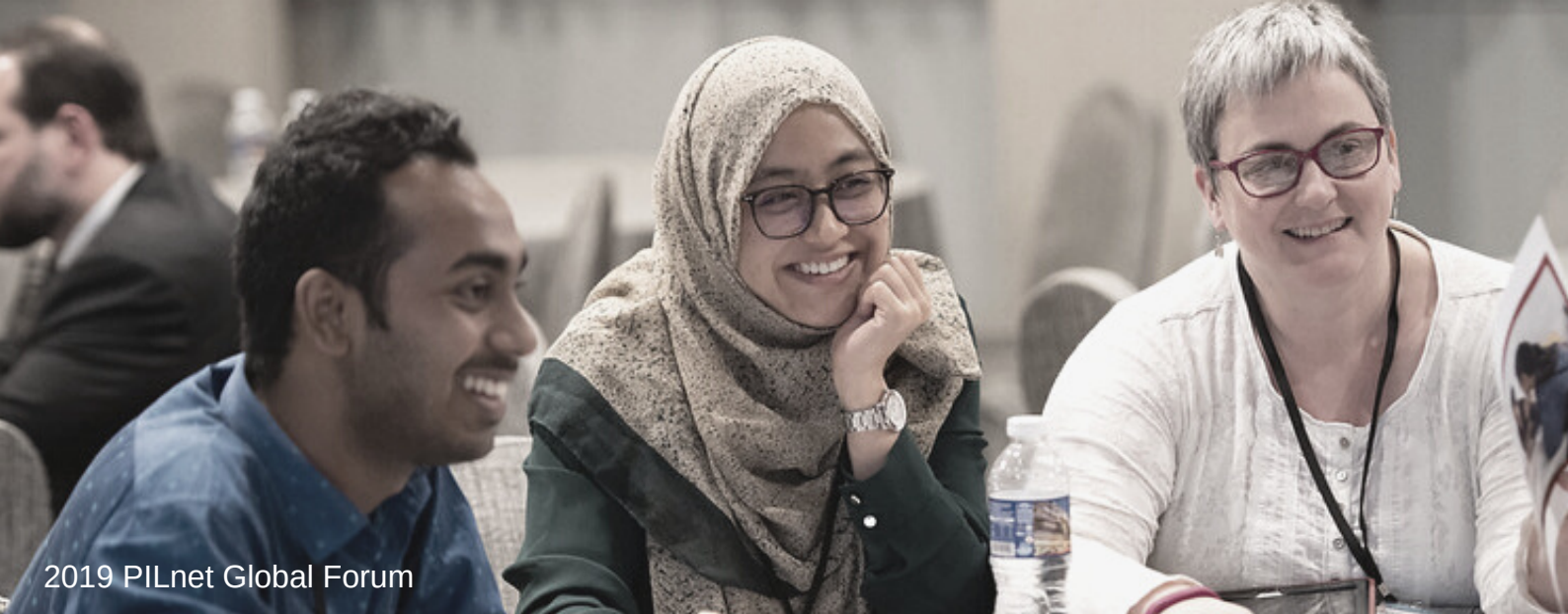
2019 PILnet Global Forum

"PILnet plays an important role in affirming the importance of pro bono legal work worldwide, especially as a convener of lawyers across sectors through its annual forum and by sparking local clearinghouses where there is no tradition of pro bono."