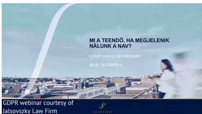
GDPR webinar courtesy of Jalsovszky Law Firm

Private lawyers engaged through the clearinghouses work on a diverse range of legal concerns brought by civil society organizations, from operational assistance, such as help with nonprofit registration, to litigation. Helping civil society build resilience on all fronts is key to creating and maintaining just societies.